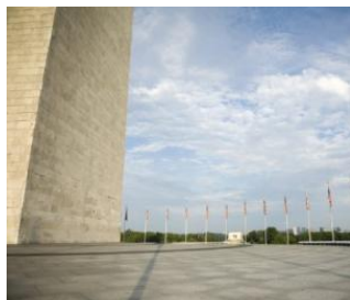
Lithologic Coring in the Lower Anacostia Tidal Watershed, Washington, D.C., July 2002: Open-File Report 2003-318